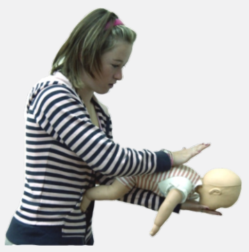
This is one method for infant- if having to act quickly where no seat is available to allow for positioning over the first aiders thigh.

Infant: Back blows - head downwards so gravity will assist with expulsion. Across your lap/thigh or over your arm. Chest thrusts – turn over.